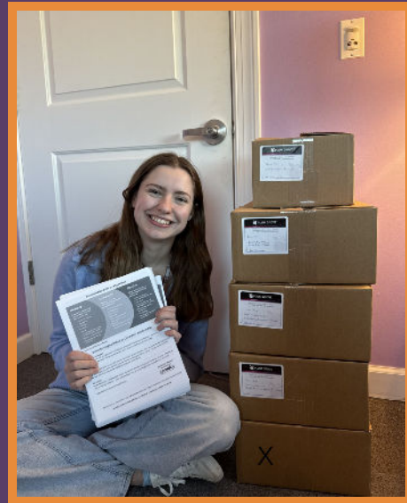
Thank you to MSUFCU for your donation for us to print our prevention Worksheets this school year.