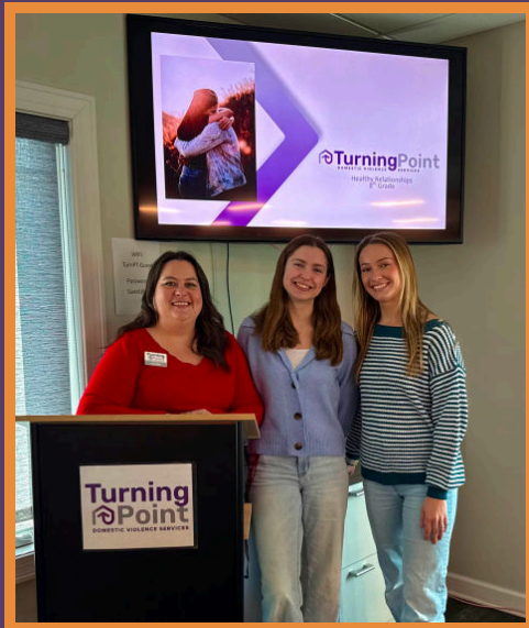
Turning Point's Outreach and Prevention Team

Year round Turning Point's Outreach and Prevention team provides presentations to pre-k through college on anti-violence education such as friendships, emotions, bullying, healthy relationship and teen dating violence awareness. We hope by having these conversations with youth and teens early they will not have to use our services down the road.