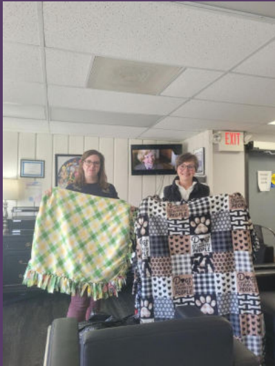
Living Waters Lutheran Church Donation