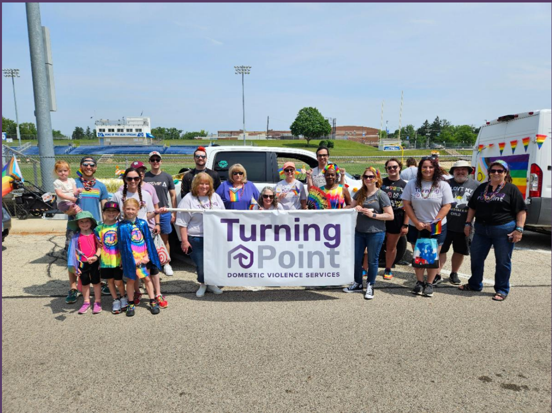
Turning Point Staff & Volunteer Walkers at Woodstock Pride 2025

At Turning Point, we welcome everyone because domestic violence impacts all of us. In honor of Pride Month, we proudly participated in the Woodstock Pride Fest this past June. Our team walked in the parade and hosted a booth to raise awareness about domestic violence and share the work we do as an agency. Turning Point remains committed to supporting anyone affected by domestic violence, regardless of gender identity or sexual orientation.