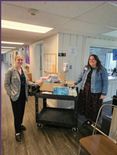
Lockton Companies Donation