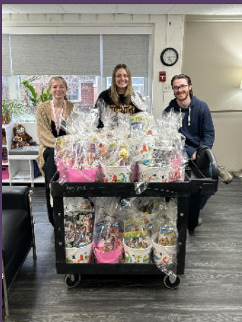
Easter Baskets donated by a local community member