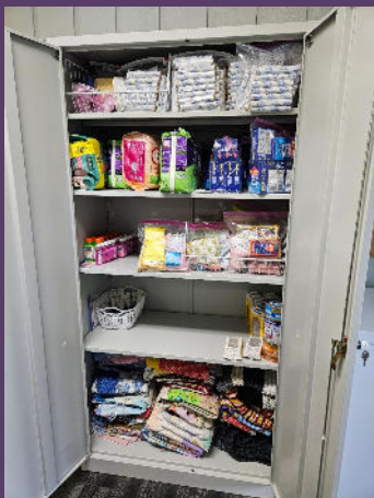
Personal Hygiene Product Pantry donated by The Period Project