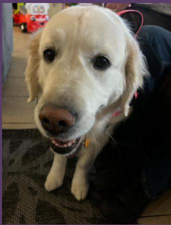
Emotional Support Dog Volunteer