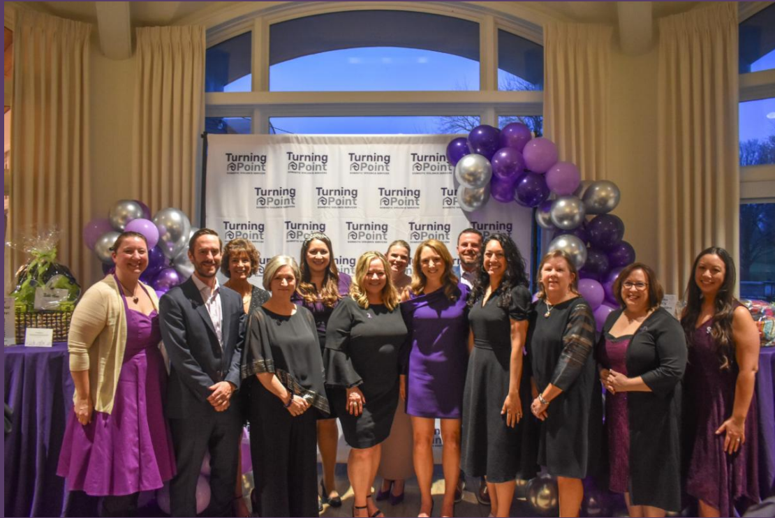
Turning Point Board of Directors: Paint the Night Purple Gala 2025